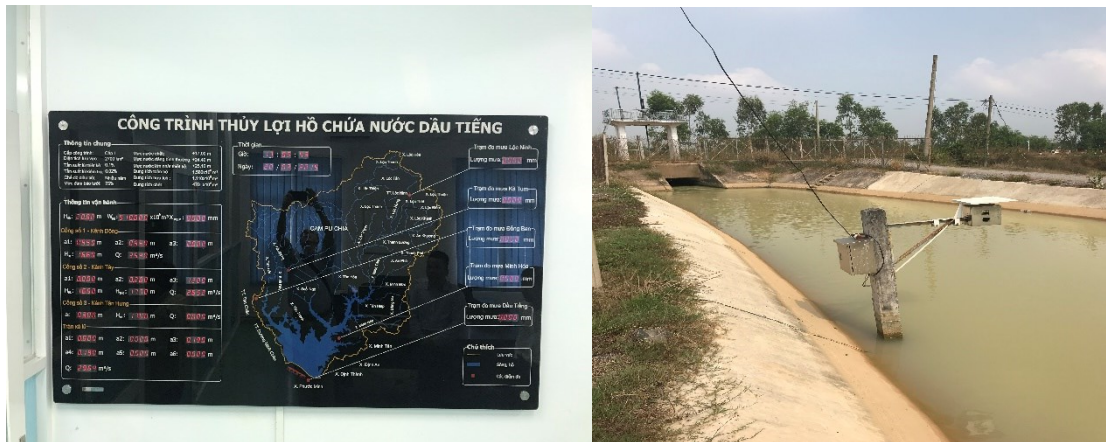
SCADA display and canal sensor