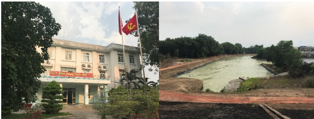
Dau Tieng-Phuc Hua IMC office, financed by the Bank Group’s first irrigation project in Vietnam, and primary canal.

The IMC has 270 staff and operates on an annual budget of D84 billion, of which about half is state budget allocation and half is water sales. This only covers staffing, operation, and maintenance, no capital investment.