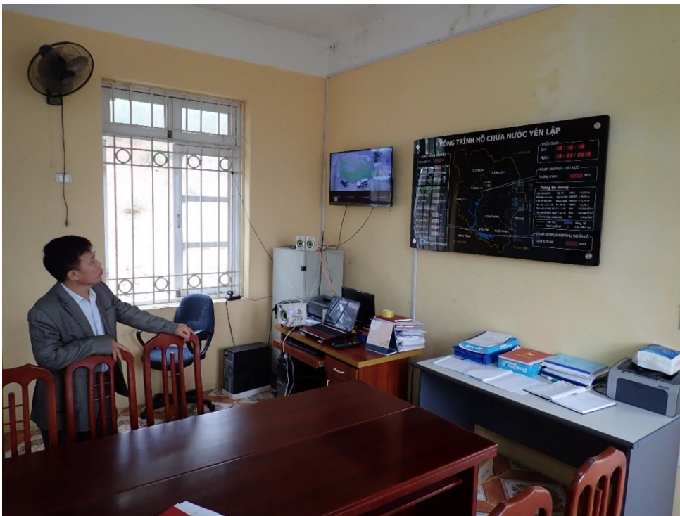
Yen Lap SCADA system for monitoring headworks and primary canals