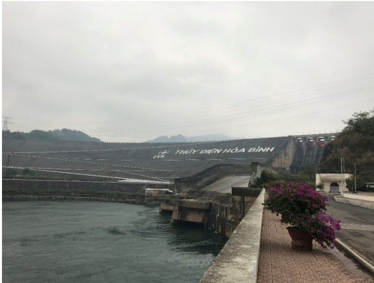
Hoa Binh Dam

Staff reported that the SCADA system is very effective and functioning well. The main drawback during project implementation was that procurement procedures that were followed resulted in the purchase of lower-cost but inferior-quality Chinese-manufactured equipment. Most of the original sensors malfunctioned shortly after the project was completed, but they have been replaced with superior European-manufactured equipment. More careful drafting of the technical specifications for SCADA equipment procurement might have resulted in the initial purchase of higher-quality sensors during the project.