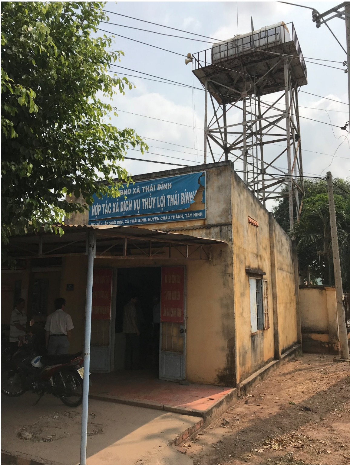
Thai Binh II Irrigation Service Cooperative (water user group) office