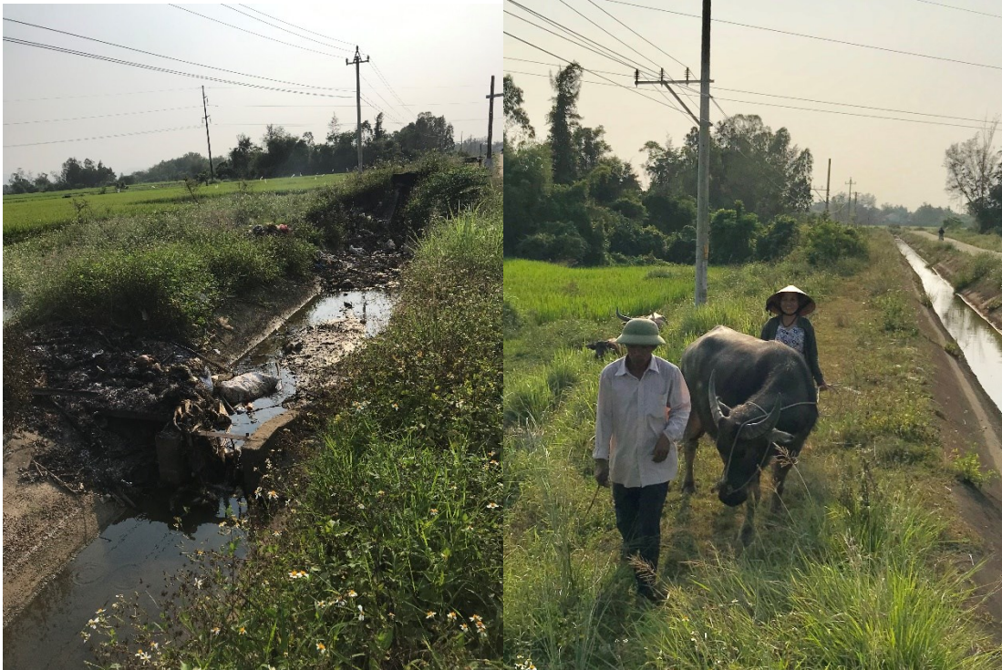
Poorly maintained secondary canal and unhappy farmers in N16 water user association service area.