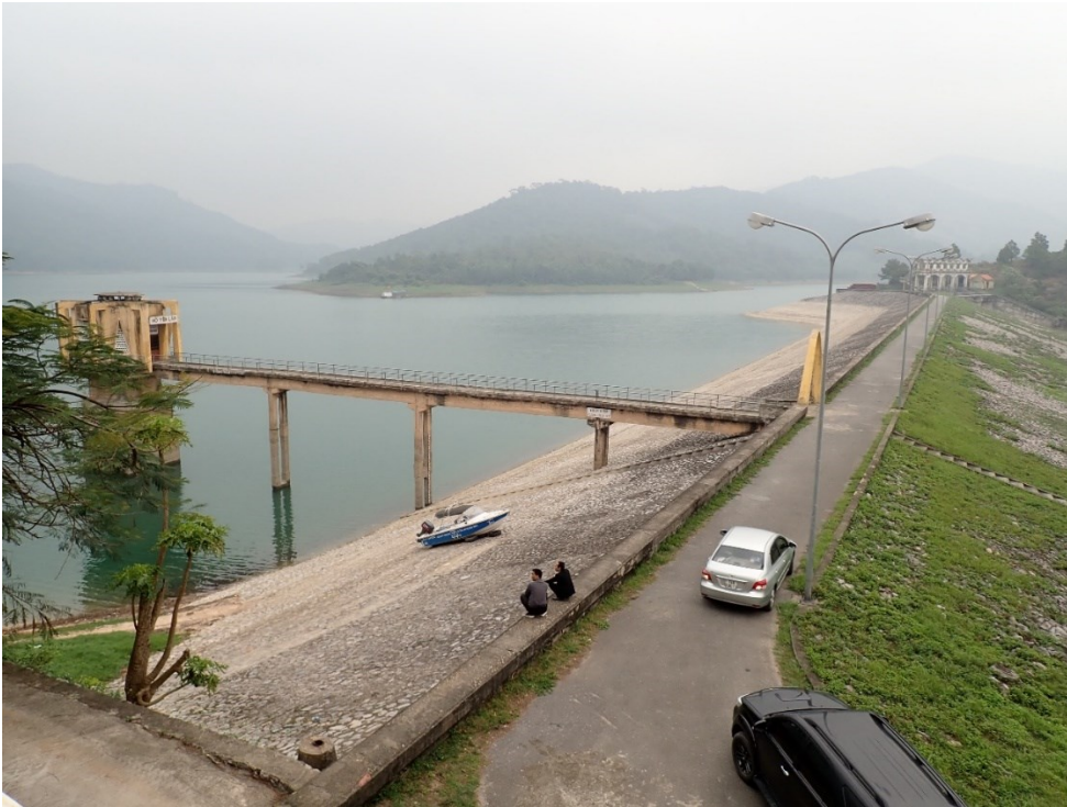
Yen Lap dam and reservoir