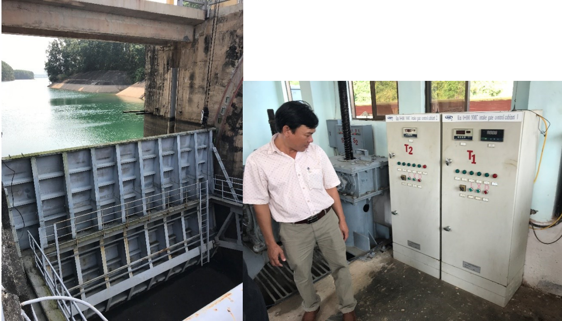
Phu Ninh spillway rehabilitated under VWRAP, and SCADA spillway control