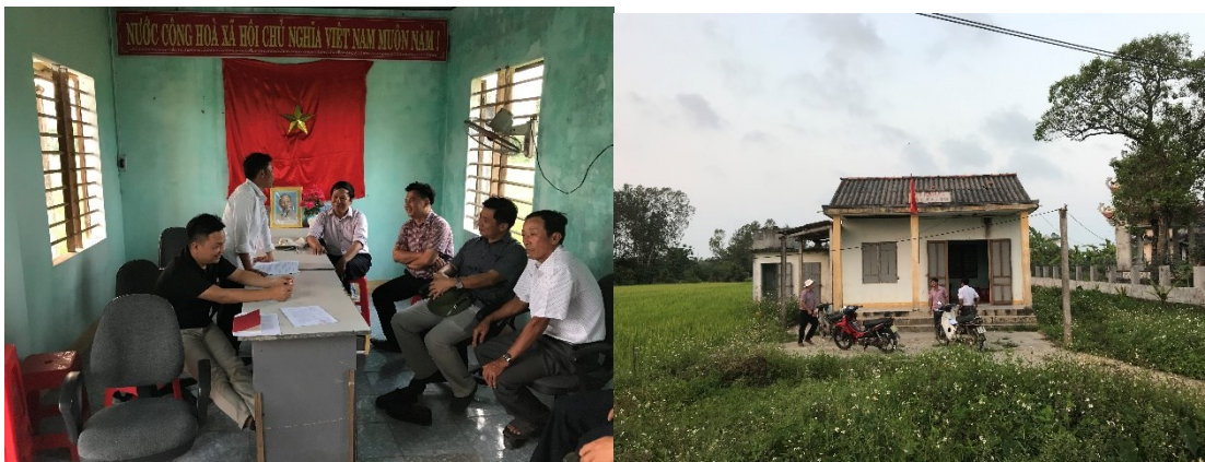
N16 water user association meeting and office, financed by VWRAP.