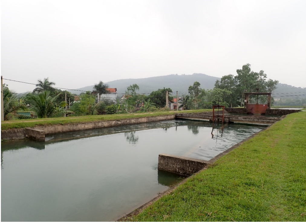
Long-crested weir, with the gated weir it replaced in the background