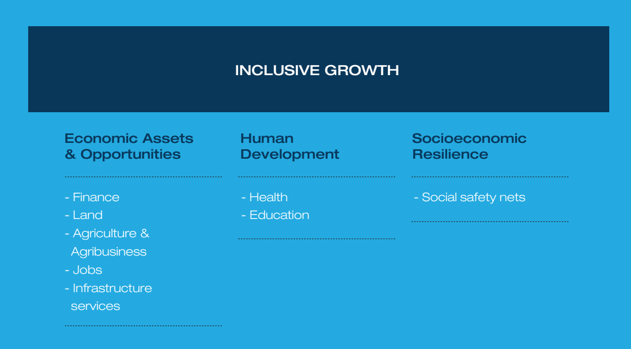
Figure 1.1. Topics of Inclusive Growth in IEG Evaluations

In synthesizing evaluative evidence, this report follows the common practice in Bank Group strategies and operations in treating all demonstrated attention to the poor and often-excluded groups (women, youth/elderly, ethnic minorities, and lagging regions) as explicit support to promote inclusive growth. While underscoring the fundamental role of growth, the report eschews discussions of Bank Group support for growth in general, or its implicit support for the poor and often-excluded through trickledown effects; instead, it focuses on the strategies and interventions that promote the inclusiveness of growth. It is also beyond the scope of this report to reflect the Management's responses to IEG evaluations, or to document the Bank Group's continuing efforts in the various areas since the evaluations.