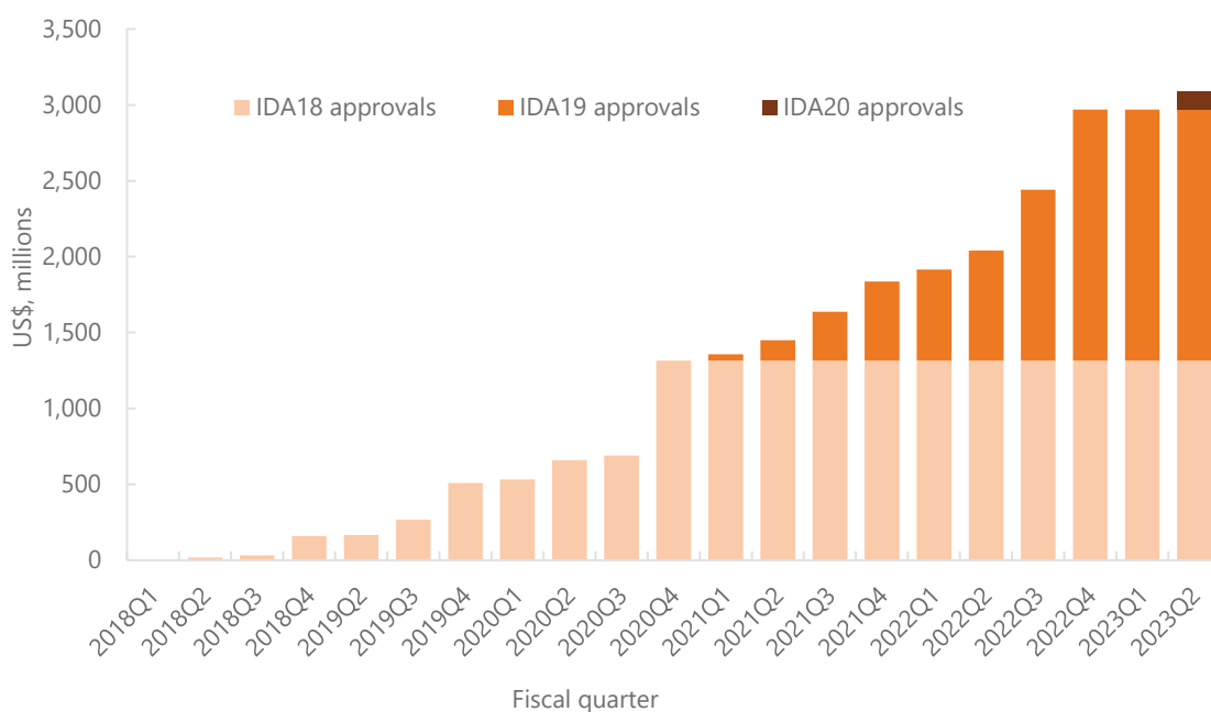
Figure A.1. Private Sector Window Facilities—Cumulative Approvals