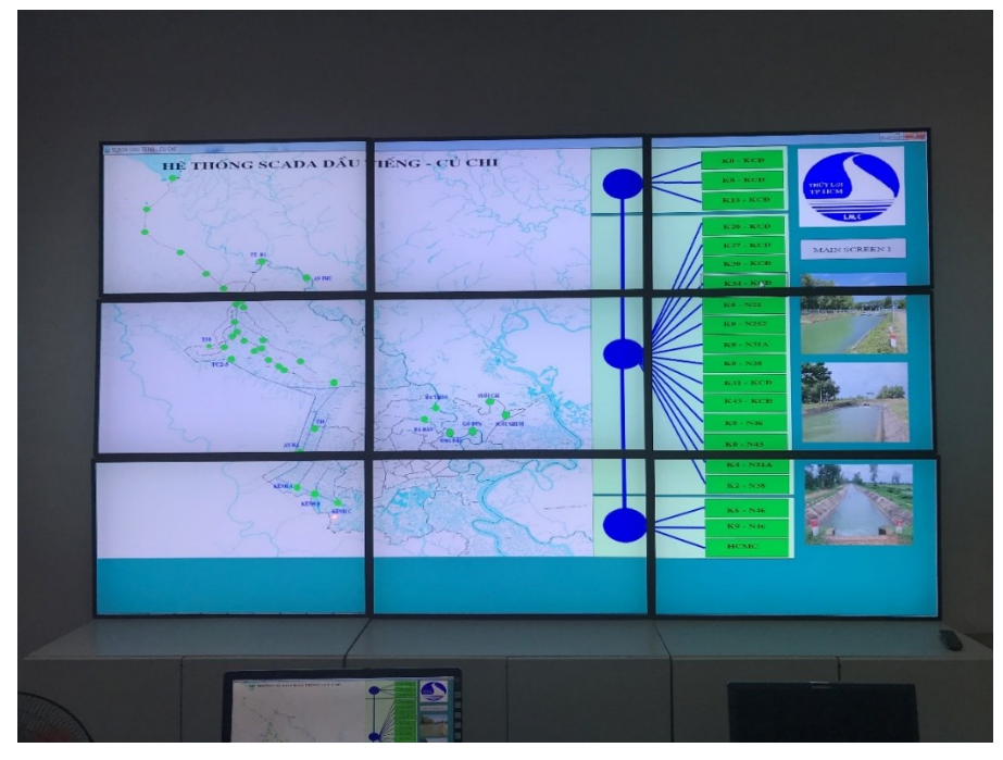
HCMC IMC's SCADA monitor wall.