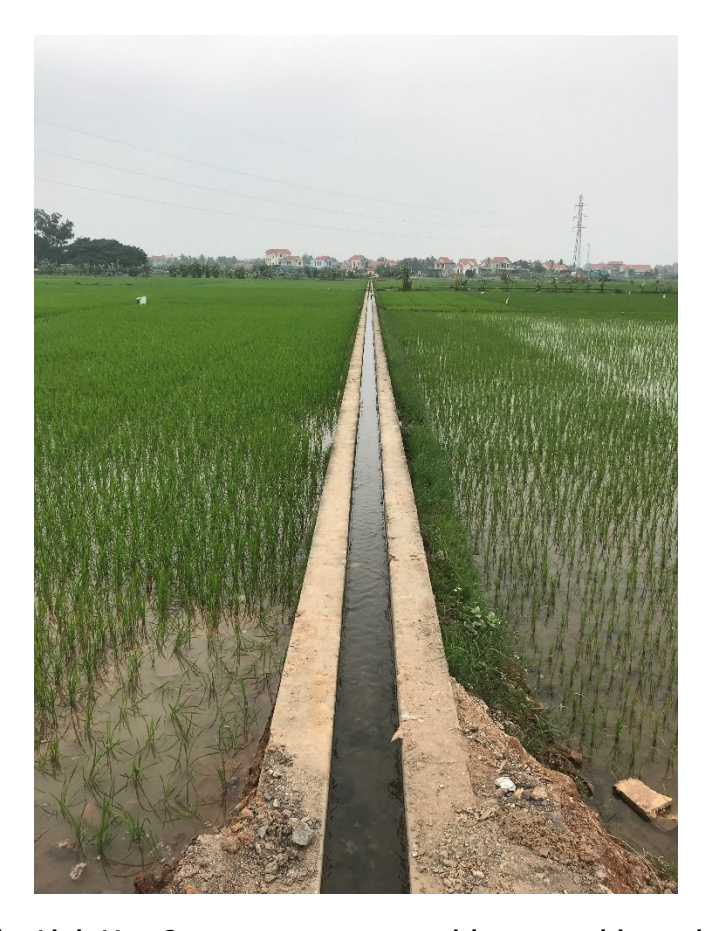
Canal managed by Linh Hoa 3 water user group, with encroaching urbanization in the background