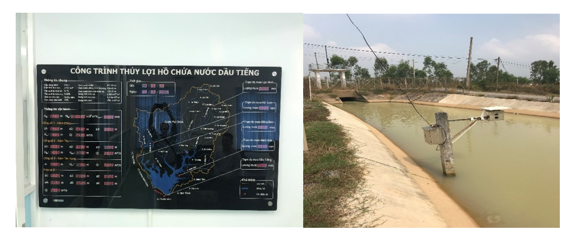
SCADA display and canal sensor