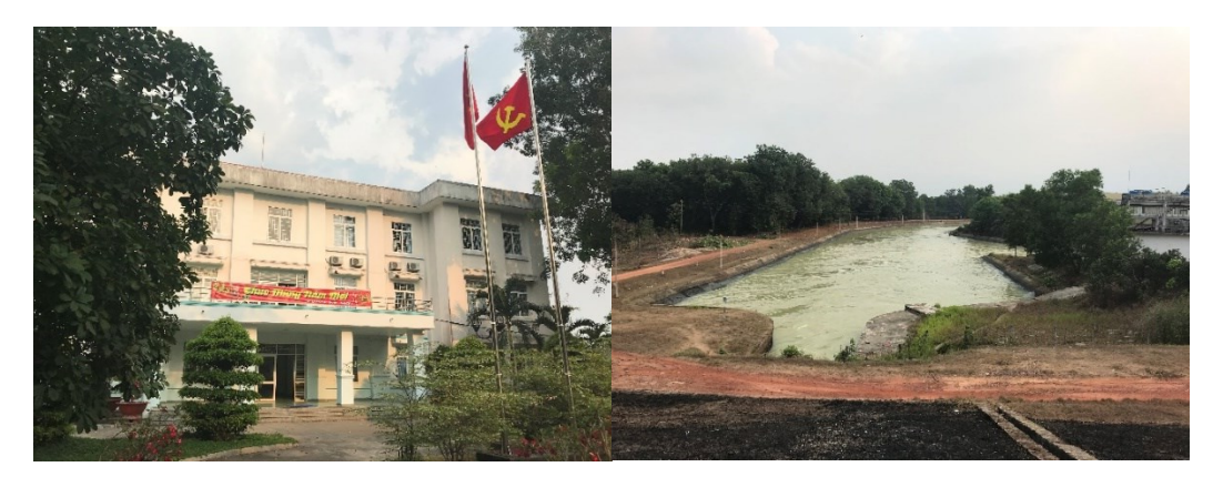
Dau Tieng-Phuc Hua IMC office, financed by the Bank Group's first irrigation project in Vietnam, and primary canal.

The IMC has 270 staff and operates on an annual budget of D84 billion, of which about half is state budget allocation and half is water sales. This only covers staffing, operation, and maintenance, no capital investment.