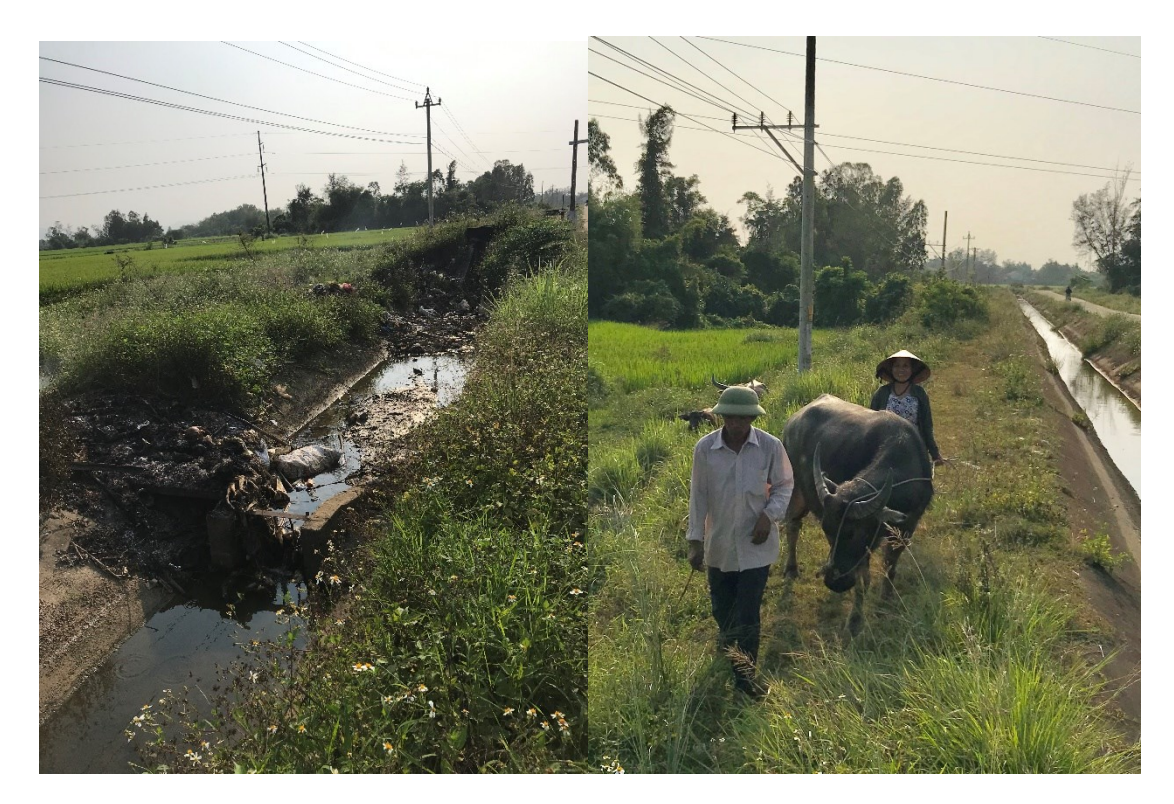
Poorly maintained secondary canal and unhappy farmers in N16 water user association service area.