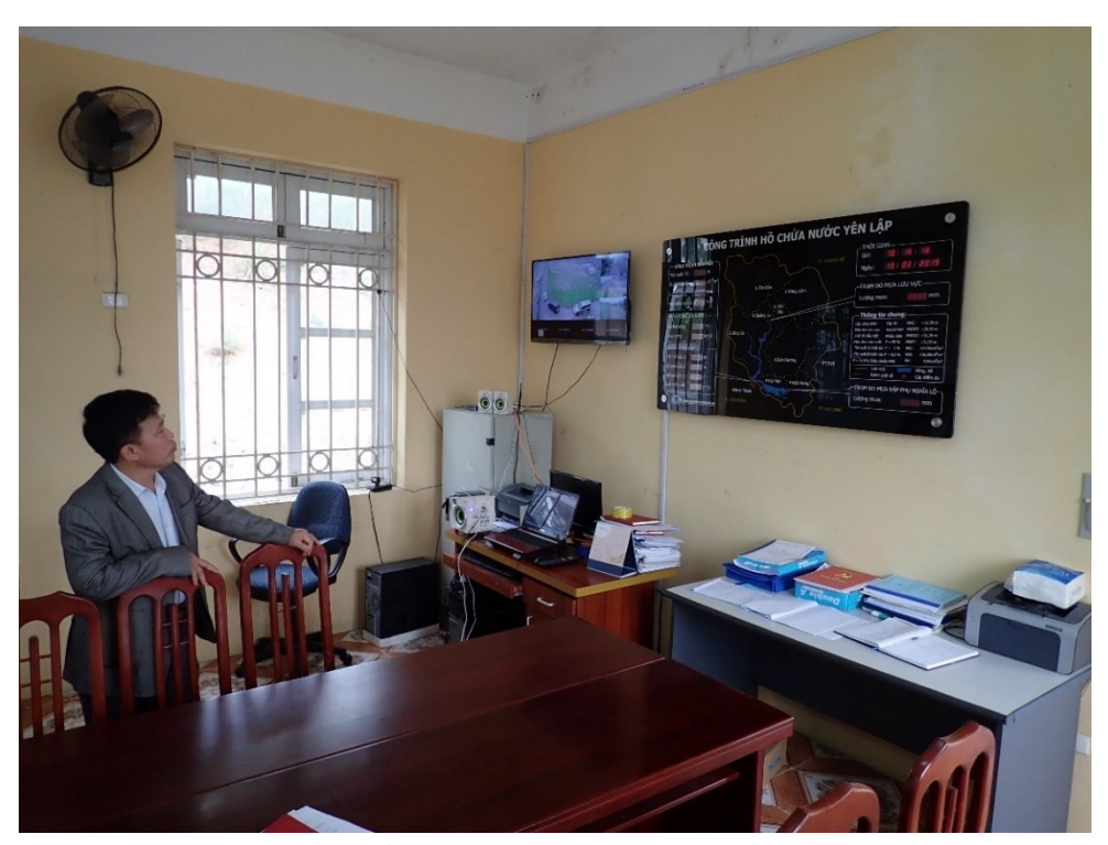
Yen Lap SCADA system for monitoring headworks and primary canals