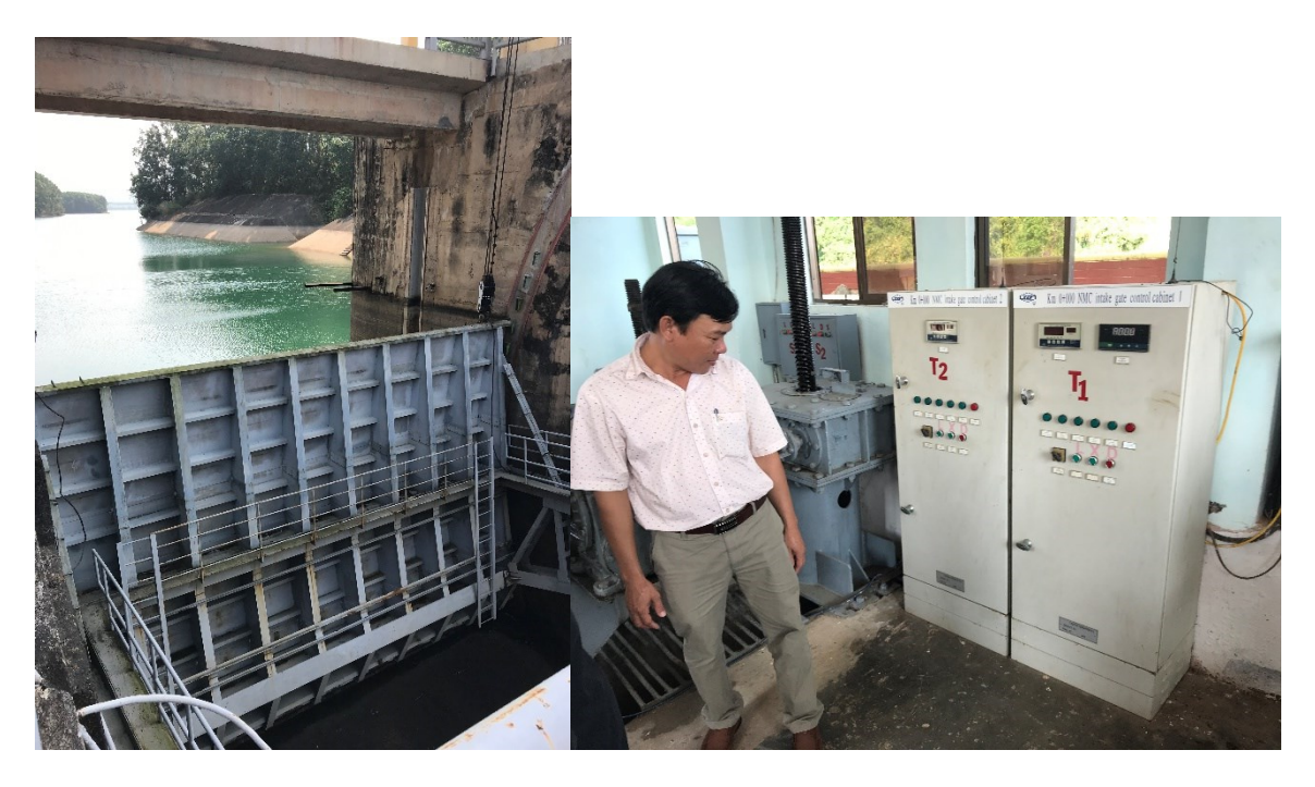
Phu Ninh spillway rehabilitated under VWRAP, and SCADA spillway control