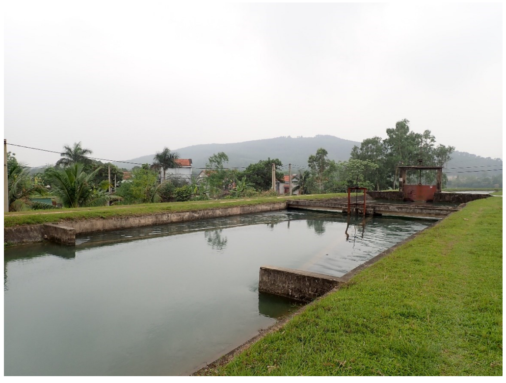
Long-crested weir, with the gated weir it replaced in the background