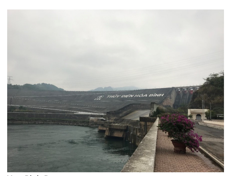
Hoa Binh Dam

Staff reported that the SCADA system is very effective and functioning well. The main drawback during project implementation was that procurement procedures that were followed resulted in the purchase of lower-cost but inferior-quality Chinese-manufactured equipment. Most of the original sensors malfunctioned shortly after the project was completed, but they have been replaced with superior European-manufactured equipment. More careful drafting of the technical specifications for SCADA equipment procurement might have resulted in the initial purchase of higher-quality sensors during the project.