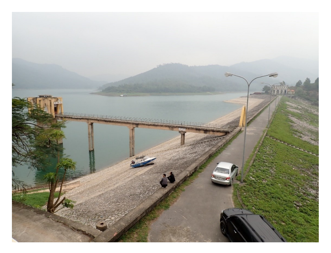
Yen Lap dam and reservoir