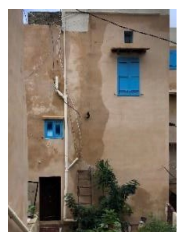
Note : CHUD = Cultural Heritage and Urban Development.

"The old cement steps were much safer. Now we go down the stairs holding our heart in our hands, frightened to fall. They're greasy like soap."—House owner, male.