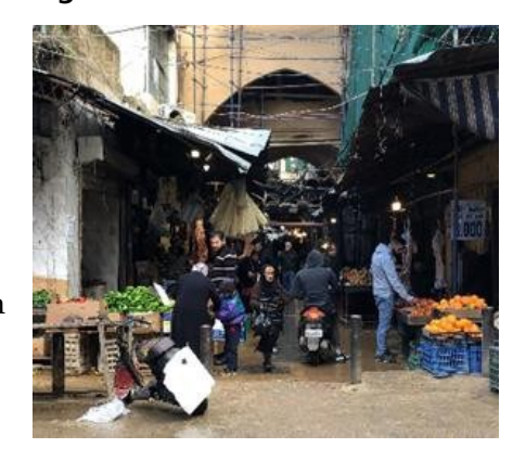
Figure 3.4. A Souk Entrance