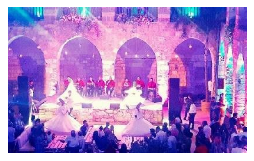
Figure 2.3. Khan al-Askar as an Event Space