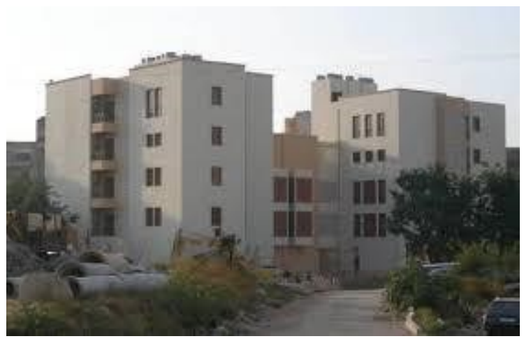
Figure 2.2. New Apartments for the Former Residents of Khan al-Askar in Tripoli