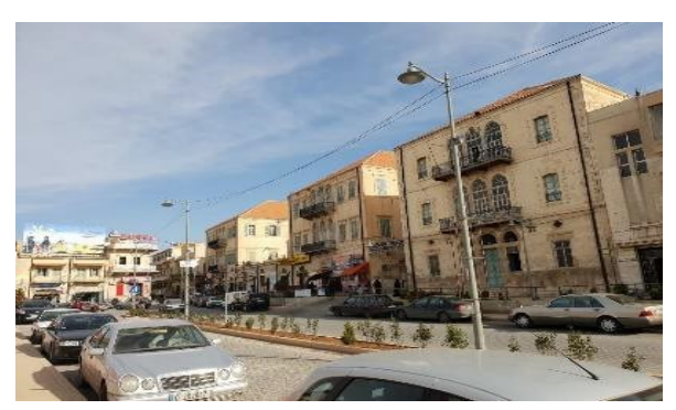
b. The lower road