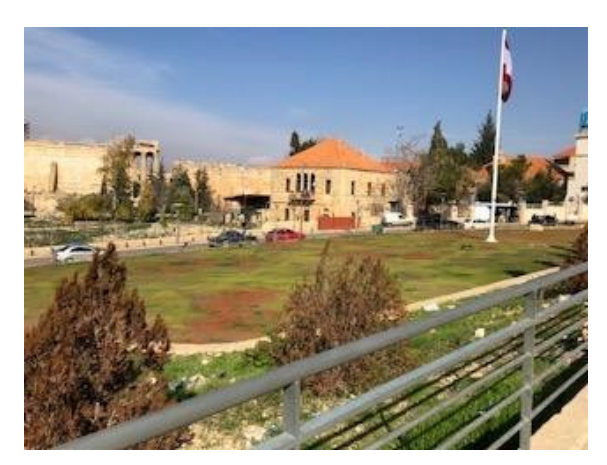
b. Al-Qualaa Road