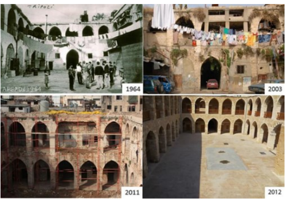
Figure 2.1. The Restoration of Khan al-Askar in Tripoli

40 shops—lived in and around the khan. The IEG assessment included visits to the resettlement areas and dialogue with some of the resettled members of the community. The assessment found that the resettlement activities were in line with the World Bank's operational policies and that the communities had received increased access to services and amenities within the assigned units. Residents indicated more could have been done to help them connect—through more sustainable infrastructure and services—to the local schools and to local economic opportunities. The residents interviewed seemed cognizant of the economic potential of the restored khan and pointed to that foregone potential.