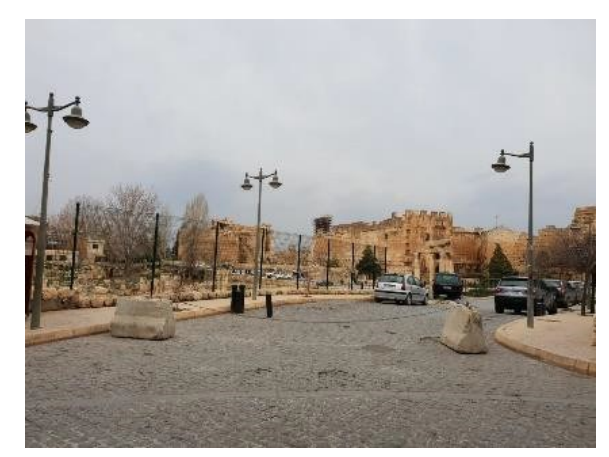
Note: CHUD = Cultural Heritage and Urban Development Project.