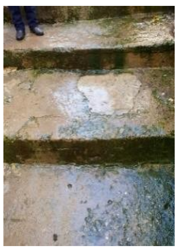
Note : CHUD = Cultural Heritage and Urban Development.