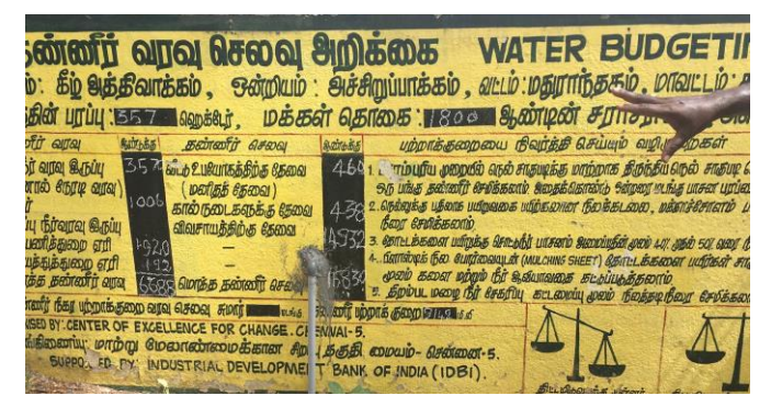
Figure B.3.5.1. Public Display of Water Budgeting Exercise, Chidambarapuram

It is not clear if the water budgeting exercise is being carried out regularly or implemented to any significant extent after project completion. However, it is recognized that changing the mind-set in favor of systematic water budgeting is a gradual process.