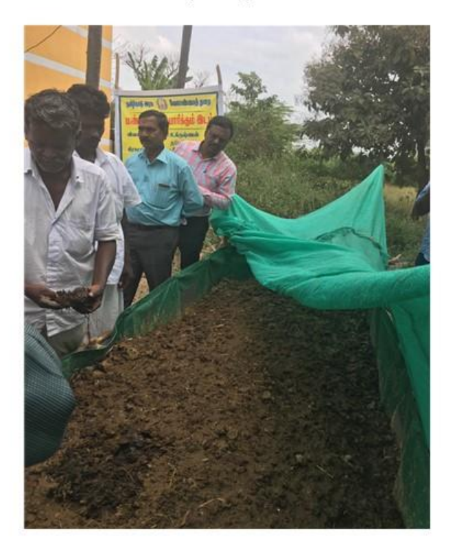
Figure 9. Portable Vermicomposting Kit in use in Keelathivakkam village