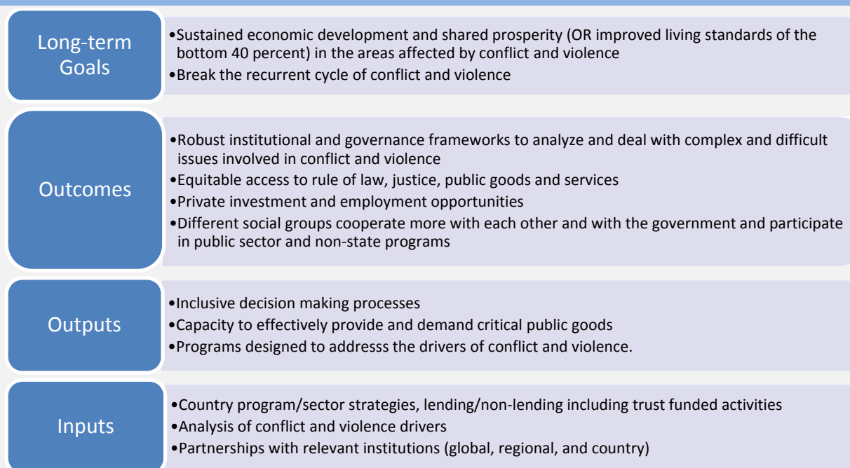
Figure 1. Results Chain of Activities to Address Pockets of Insecurity

21. The results chain that guides this evaluation reflects the unique challenges associated with the issues in conflict and violent situations. The framework developed for this evaluation is shown in Figure 1 below. The following sections provide more specific descriptions of the each segment of the results framework.