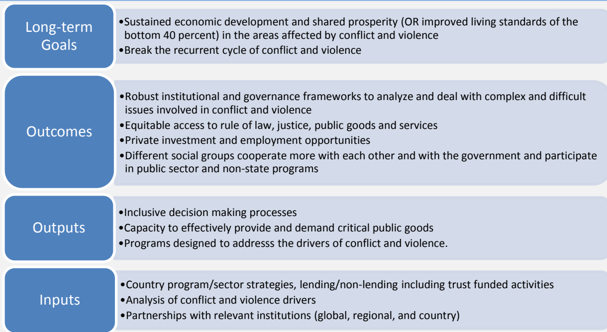
Figure 1. Results Chain of Activities to Address Pockets of Insecurity

21. The results chain that guides this evaluation reflects the unique challenges associated with the issues in conflict and violent situations. The framework developed for this evaluation is shown in Figure 1 below. The following sections provide more specific descriptions of the each segment of the results framework.