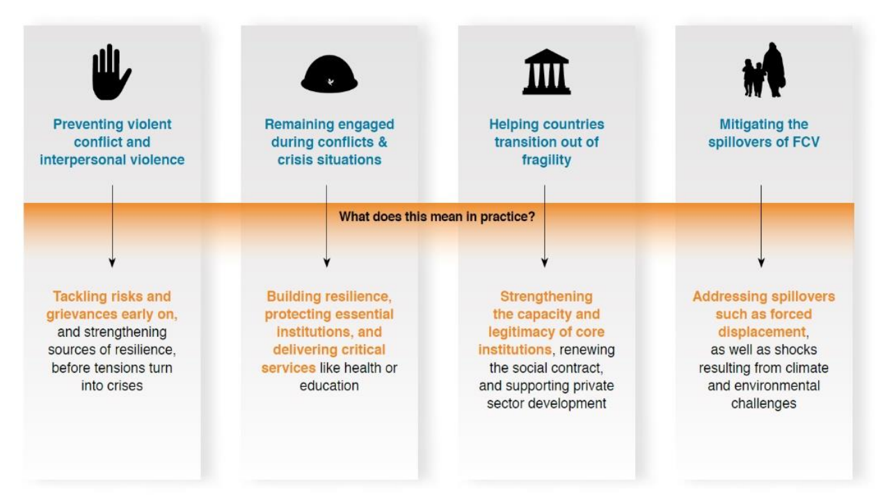
Figure 1.2. Multipronged Approach for Conflict Situations from the World Bank Group's FCV Strategy

Note: FCV = fragility, conflict, and violence.